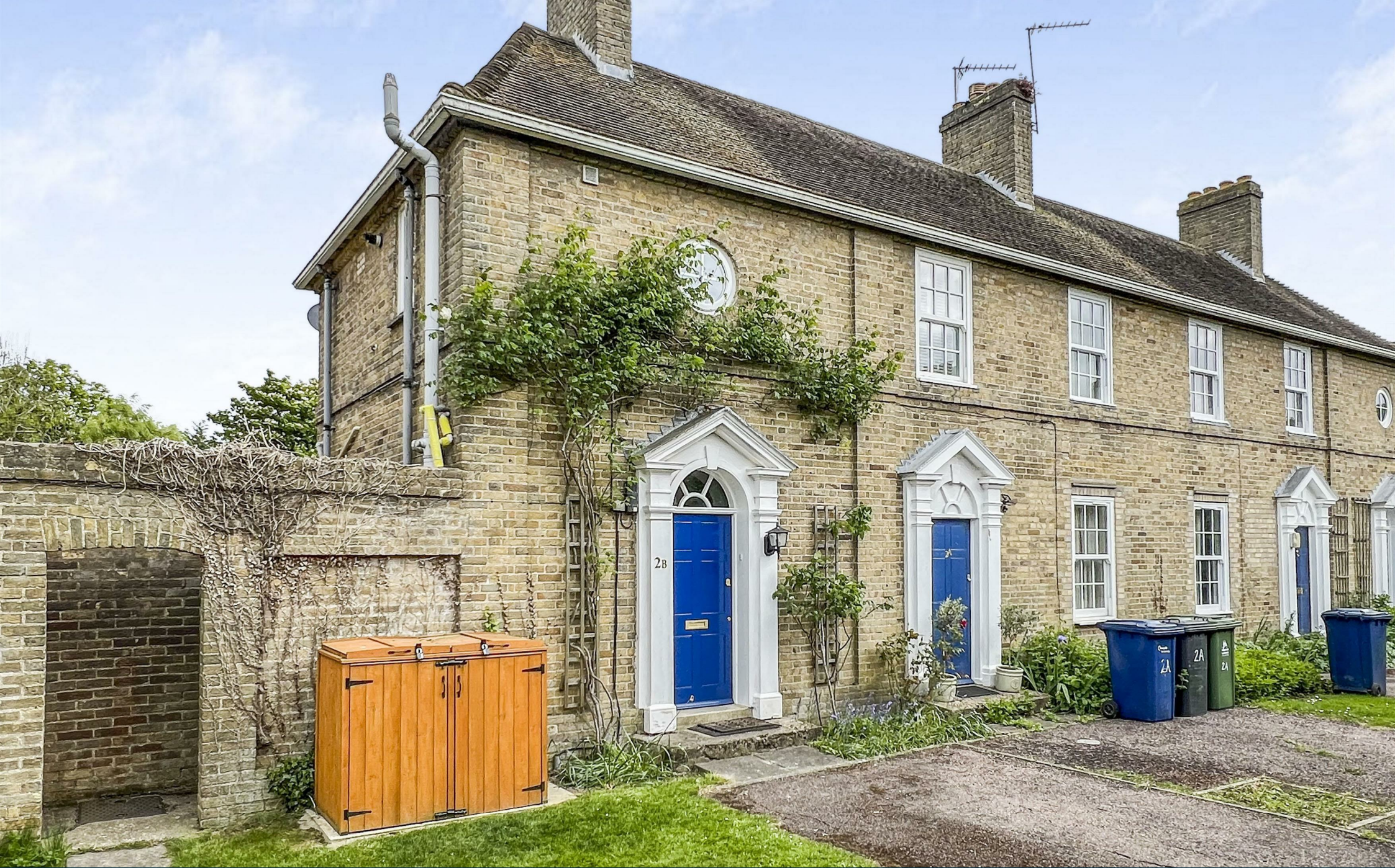
Howes Place, Cambridge, CB3 0LD